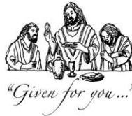
"Given for you..."

Thursday, March 29: Maundy Thursday [7:30 p.m. Service w/ Holy Communion & Laying on of Hands]